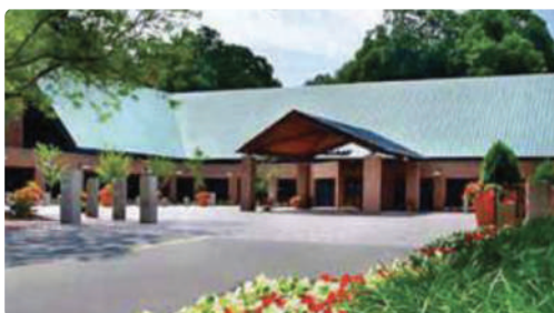
Princeton Marriott at Forrestal Princeton, NJ

Hear from thought leaders on industry trends